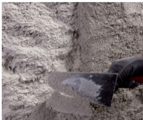
Applying Mape-Antique MC over Mape-Antique Rinzafo

Even though Mape-Antique MC contains products which constrict the formation of micro-cracks, it is good practice to apply the mortar when the wall is not exposed to direct sunlight and/or wind. In such cases, such as during hot and/or particularly windy weather, take special care when curing the render, especially during the first 36-48 hours. Spray water on the surface or employ other systems to prevent the mixing water evaporating off too quickly.