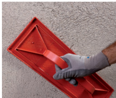
Levelling the surface of Mape-Antique MC