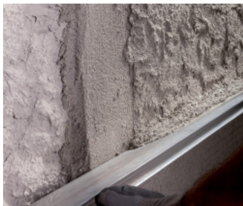
Levelling the surface of Mape-Antique MC with a straight edge